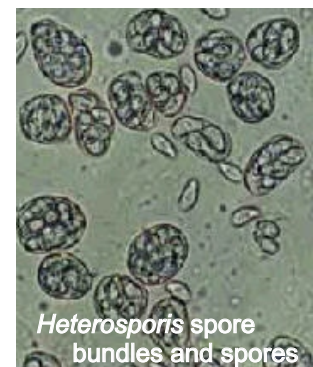
Heterosporis spore bundles and spores

The Heterosporis Life Cycle. Heterosporis is a microsporidan parasite and part of its life cycle includes the formation of spores inside muscle cells. The spores are the infective stage of the parasite. Infection occurs when a fish eats an infected fish, or when a fish is exposed to spores in the water. Spores are released into the water when an infected fish dies and decomposes and can remain infective in water for at least two months at room temperature and up to one year in refrigerated water. Based on lab studies, opaque areas of infection in the muscle are visible to the eye about 5 weeks after a fish becomes infected. Over time, the entire muscle mass of a fish will be filled with spores and the entire fillet will become white and opaque.