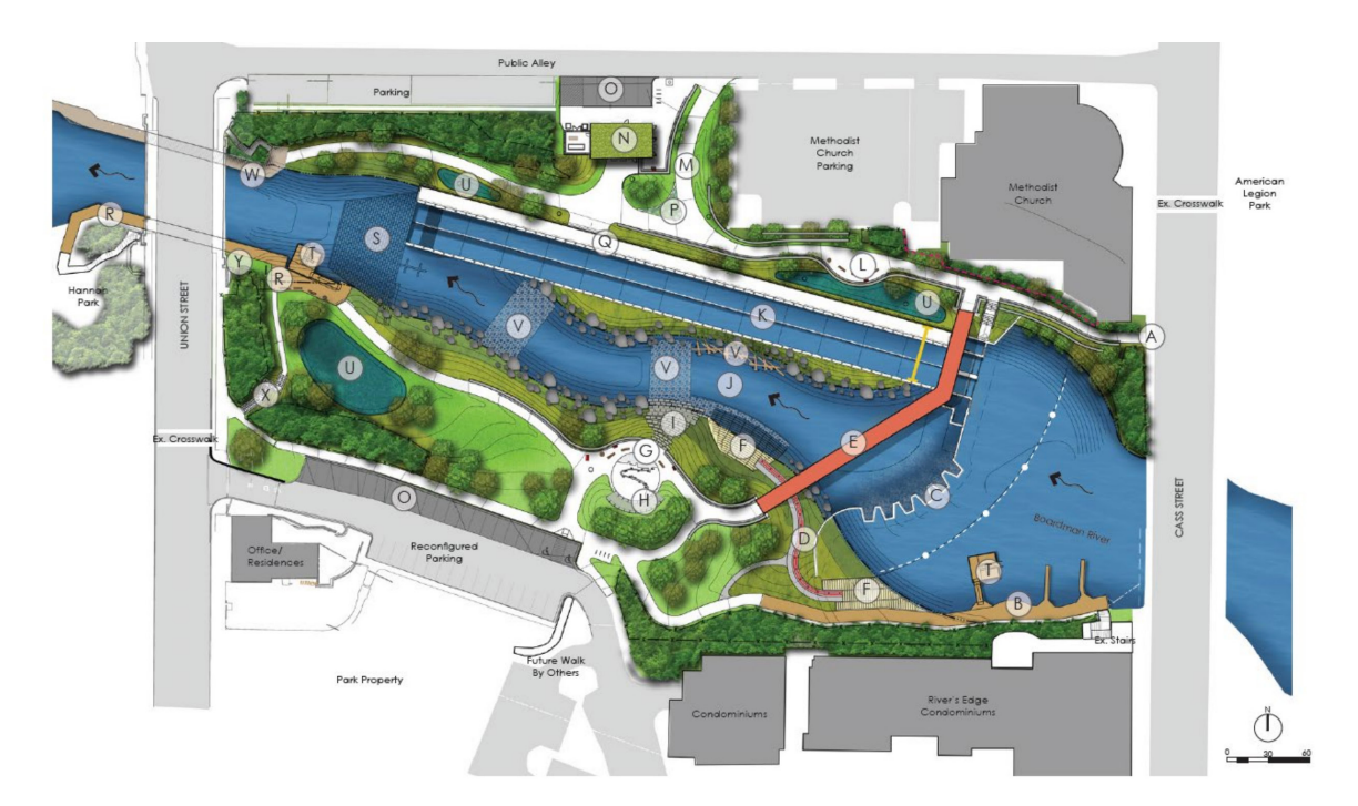
Figure 1. Conceptual rendering of the FishPass facility. The Boardman River flows from bottom to top. Site features include: (A) new pedestrian connection to Cass St.; (B) rehabilitated boardwalk and accessible kayak launch; (C) labyrinth weir; (D) kayak portage rail; (E) pedestrian bridge; (F) kayak shore access; (G) interpretive overlook 1; (H) outdoor classroom and amphitheater; (I) fishing area; (J) bypass channel with boulder armoring and native vegetation; (K) fish-sorting channel; (L) interpretive overlook 2; (M)) service drive/pedestrian walk on city easement; (N) FishPass researcher building/public restrooms; (O) pervious pavers; (P) Turfstone vehicular access; (Q) research access way and security fence; (R) new boardwalk; (S) tailwater entrance pad; (T) boardwalk overlook and accessible kayak launch; (U) rain garden to manage building/parking runoff; (V) stream riffle habitat; (W) future boardwalk by others; (X) reconstructed stairs; and (Y) stairs to be removed.

Three workshops of fishery biologists and engineers were hosted in 2016-2018 to identify site-specific needs and design elements to allow bi-directional selective passage on the basis of the ecology of target species. The workshops also facilitated evaluation of four alternative concept designs to identify a solution that is maximally flexible to accommodate various fish sorting technologies and techniques. A public open house was hosted in 2017 to gain input on current use of the site and what infrastructure, greenspace, and educational features to include in site design and a workshop was hosted in 2018 with the angling community to hear about their concerns and interests. FishPass is currently funded by the Great Lakes Restoration Initiative and led by the Great Lakes Fishery Commission (GLFC) in partnership with the City of Traverse City, the Grand Traverse Band of Ottawa and Chippewa Indians (GTB), the Great Lakes Fishery Trust (GLFT), the Michigan Department of Natural Resources (MIDNR), the U.S. Army Corps of Engineers (USACE), the U.S. Fish and Wildlife Service (USFWS), and the U.S. Geological Survey (USGS). Governance of the FishPass project will be conducted by an Advisory Board consisting of at least one representative from each partnering agency and experts in fish passage.