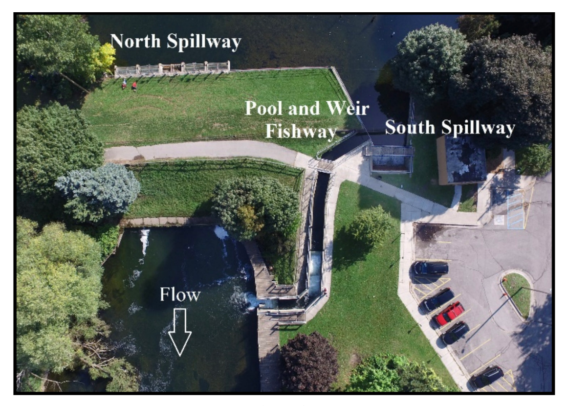
Figure 3. Aerial view of Union Street Dam. The south spillway outlet (not in view) is located immediately downstream of intake.

Traverse City is home to an active local population and attracts tens of thousands of tourists annually. Both locals and visitors like Traverse City for the variety of outdoor activities it offers, and the Boardman River is a major attribute. Below the Union Street Dam, the Boardman River winds its way through downtown Traverse City. River-related activities include paddling, fishing, wildlife viewing, hiking, and pub-crawling, just to name a few. Any deviation from the status quo that concerns the Boardman River elicits considerable interest, both from those who seek and resist change. The river has long been the subject of a broad, comprehensive "natural river plan" that envisions dam removal, fishery improvements, better land use, and incorporation of the river into the city's goals for downtown development and livability. This "natural river plan" has been a priority for a wider range of partners including the State of Michigan, the Grand Traverse Band of Ottawa and Chippewa Indians, and the City of Traverse City. The city and chamber of commerce have promoted the Boardman as a key feature of the "cityscape," and some local businesses have incorporated the river into their business plans (e.g., a pub crawl by kayak).