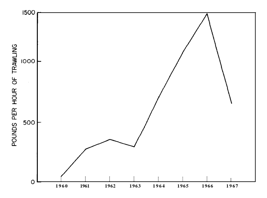
Figure 1. Relative abundance of adult alewives taken in experimental and Commercial bottom trawls in southern and central Lake Michigan, November 1960-67.

An aerial survey on June 22 revealed that the alewife dieoff extended around the circumference of the lake from Arcadia, Michigan, south to Michigan City, Indiana, and along the west shore to Sturgeon Bay, Wisconsin (Fig. 2). Dead alewives were also seen along the east shore of Green Bay,