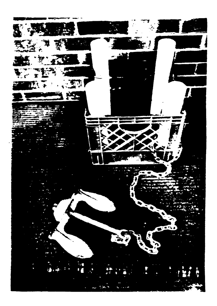
Figure 3. Sedimnttrapconstruchd with 2 inch PVC pipe plugged with No. 11 stopper.

merits in securing this trap are needed. Anchoring the sediment traps to an incubator anchoring line may jeopardize the incubators if the traps, which protrude above the gravels, are snagged by ice or woody debris. Therefore, the sediment traps should be anchored independent of the incubators. Analysis of organic matter and particle size of sediments from the traps should be as described by Buckhanan (1971) and Manny et al. (1978). In addition to the sediment data , water temperatures should be recorded when the incubators are deployed and retrieved.