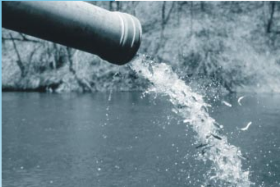
Chinook salmon stocking in a Great Lakes tributary.

THE LAKE ONTARIO COMMITTEE recognized a significant window of opportunity to reintroduce the extirpated bloater chub and pledged to produce an operation and assessment plan. The committee completed the Lake Ontario Atlantic Salmon Rehabilitation Plan and submitted it for publication. The committee recognized the importance of the cormorant issue and noted that studies are being conducted on fish predation by cormorants.