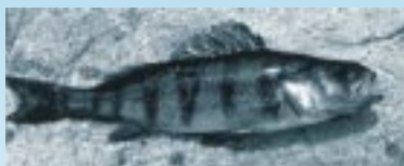
The Great Lakes Fishery Commission sponsored research on assessing genetic population of yellow perch.