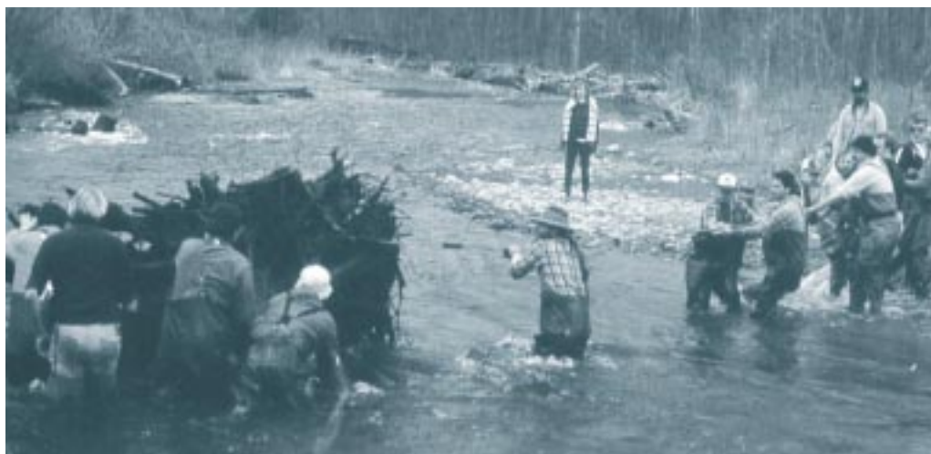
Habitat restoration on a Great Lakes stream.